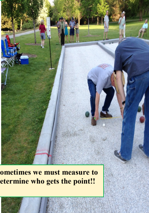
Sometimes we must measure to determine who gets the point!!