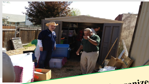
Supply shed—cleaned up and organized!